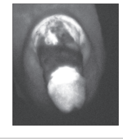
Figure 6. Fluorescent angiography after completion of HBO<sub>2</sub> therapy shows restoration of normal flow to the glans and base of the shaft (left) .

Debridement of the eschar was done 20 days after replantation and a split-thickness skin graft was performed (Figure 5). HBO<sub>2</sub> therapy continued after the skin graft to the shaft. A meatal stenosis also developed which was corrected. Figure 6 is an image from the fluorescent angiography study performed after completion of HBO<sub>2</sub> therapy.