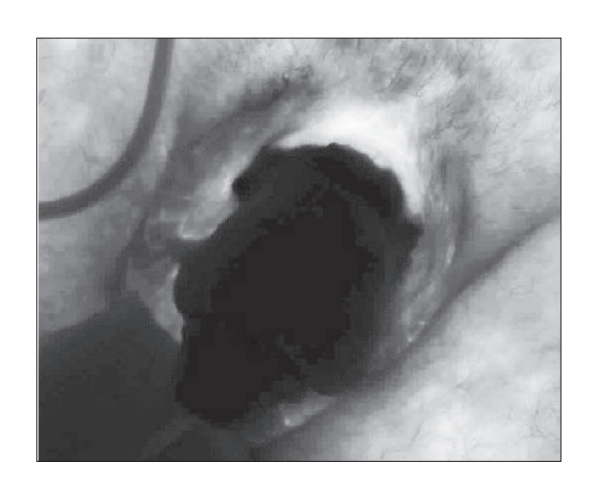
Figure 1. Postoperative fluorescent angiography performed prior to initiation of HBO<sub>2</sub> therapy showed no perfusion in the replanted penis distal to the anastomosis.