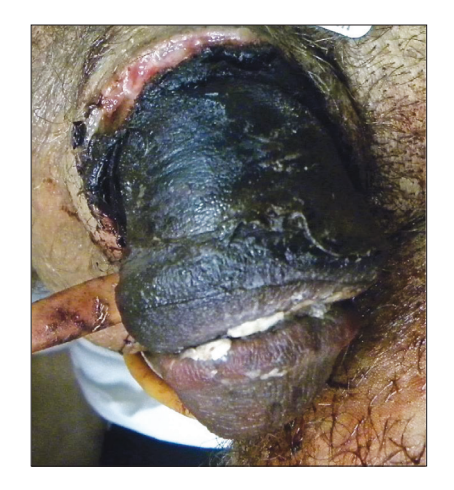
Figure 4. Skin necrosis of the shaft.

The patient was treated postoperatively with the phosphodiesterase inhibitor tadalafil (Cialis, registered trademark Eli Lilly and Company) at 10 mg once daily, and HBO<sub>2</sub> therapy. Monitoring the viability of the replanted penis was done by clinical examination. Figure 2 shows the appearance of the replant prior to and following the first HBO<sub>2</sub> treatment on postoperative day 2. HBO<sub>2</sub> was started 72 hours after amputation and 58 hours after replantation. Treatments were performed with 100% oxygen at 2.4 atmospheres absolute (ATA). The patient