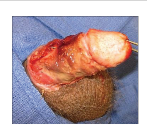
Figure 5. Debridement of necrotic skin ( above ) followed by split -thickness skin graft to the shaft of the replant ( right ).