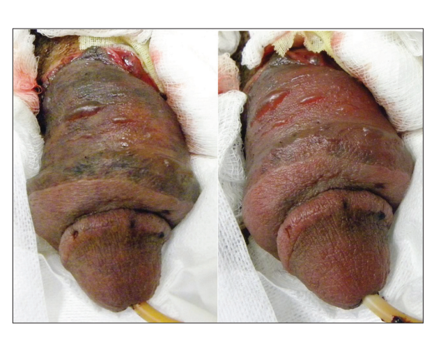
Figure 2. The left image shows the attached replant prior to first HBO<sub>2</sub> treatment. The image on the right is the appearance after the first HBO<sub>2</sub> session. The tissue is pinker due to hyper-oxygenation. The blisters present are ischemic blisters.