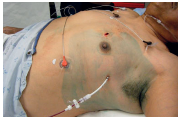
Fig. 1 Pigtail catheter inserted laterally

Both pigtail catheters and chest tubes were inserted at the bedside by the attending trauma surgeon or by a surgical resident under the supervision of the in-house attending trauma surgeon. One per cent lidocaine was given for local anaesthesia, along with an intravenous morphine injection